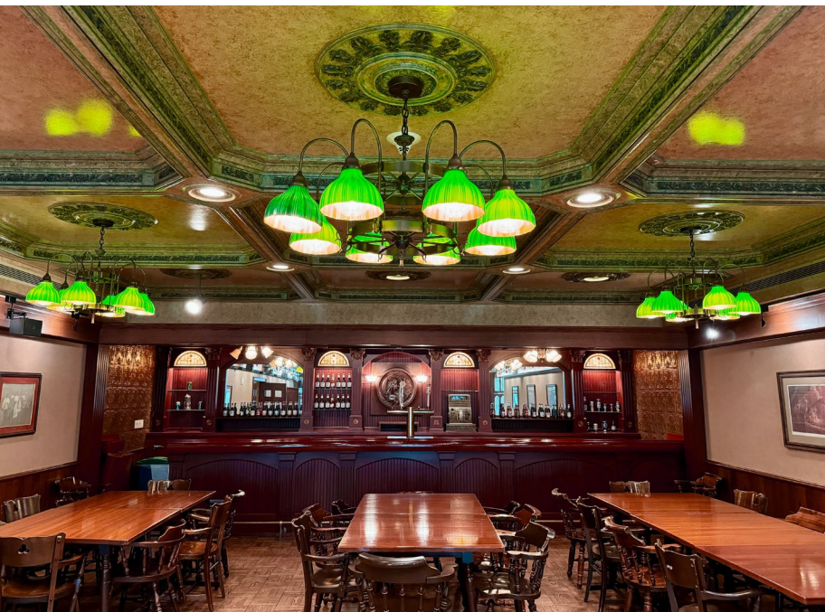
HIGH LIFE ROOM